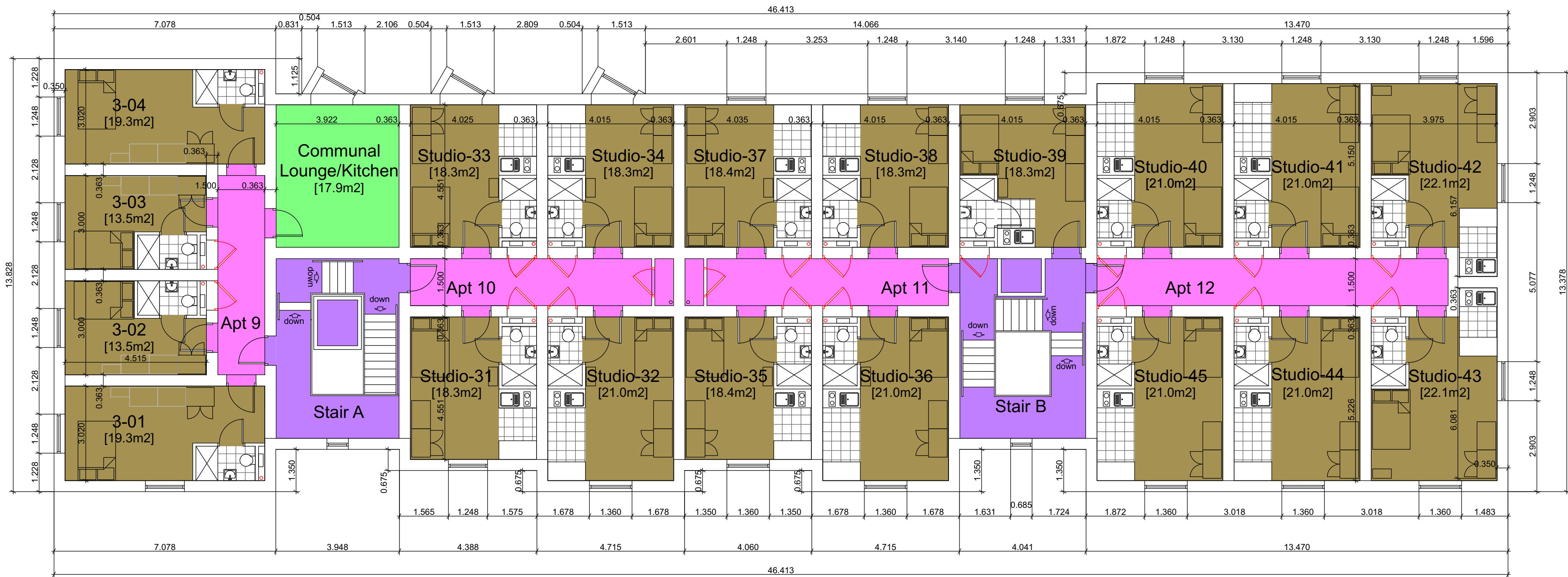
PROPOSED SECOND FLOOR PLAN

Areas shown in [brackets] are Approx Gross Internal Floor Areas